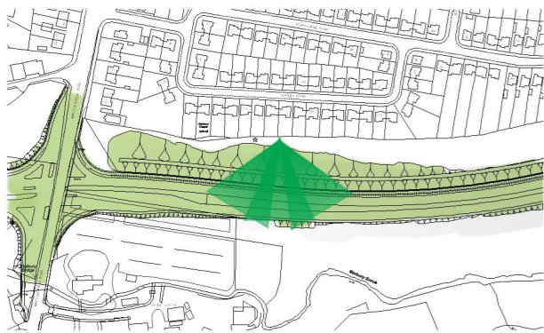
Image location: rear garden of property on Darley Road overlooking field

Photomontage images as prepared for Planning Submission, October 2013. This Photomontage has been created by the SEMMMS team using a methodology as stipulated by the Landscape Institute (LI) Advice note '01/11 Landscape Institute - Photography and Photomontage in Landscape and Visual Impact Assessment'. No part of this image may be copied without written permission from the SEMMMS Team.